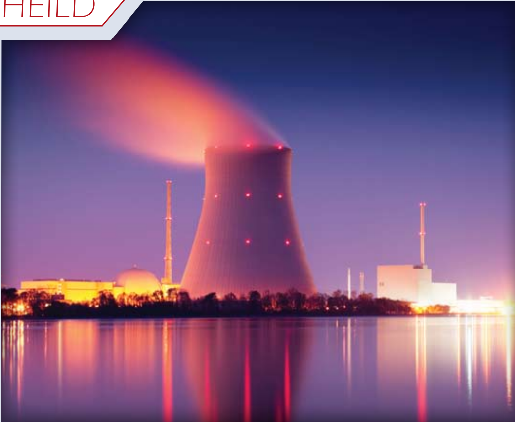
Borated Polyethylene Sheet